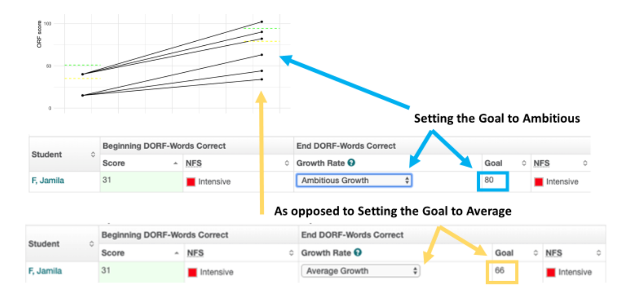
Figure 1. Illustration of DIBELS Data System growth goal setting tool.

Figures 2 and 3 illustrate two complimentary ways of using the DDS to evaluate growth goals after end of year (EOY) data has been collected and entered. Figure 2 depicts an evaluation of individual growth, and shows in the two rightmost columns that although Jamila, the grade 2 student illustrated in Figure 1, is still in the highest level of risk, she met the ORF goal set for her, and in doing so, grew at a rate higher than 81 percent of her peers with similar BOY skills. In contrast, Suzanne, who had a similar BOY score, showed below average growth, and did not meet the goal set for her. Figure 3 depicts one way to evaluate literacy growth at the systems level, and summarizes for a classroom or school the number and proportion of students with growth goals set, the number and proportion of students who met their goal, the number of students whose growth fell in each of the five growth zones, and the number of students who met their established goal, subset by goal type.